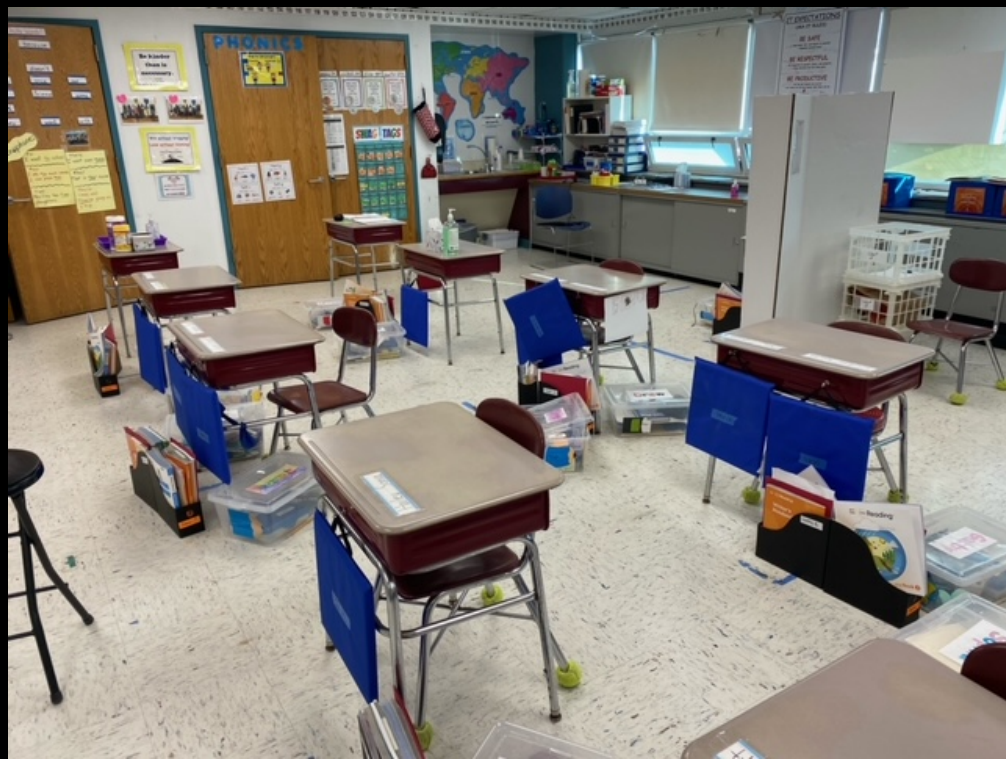
Grade 2 with 22 desks