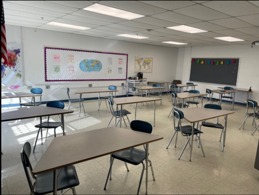
Two students per table