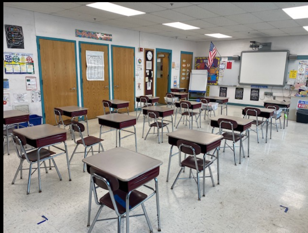
Grade 3 with 22 desks