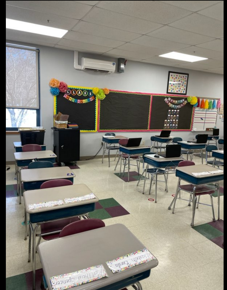
3 foot distance grades 5/6