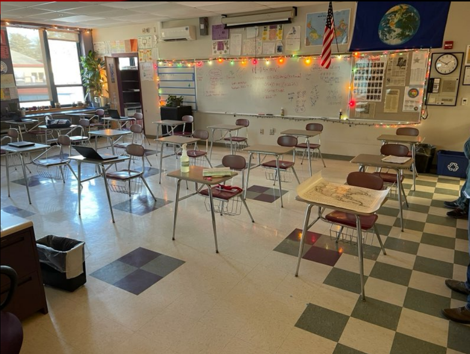
5 foot distance grades 7 and 8