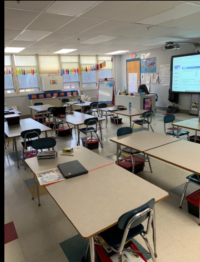
Grade 2 with Tables