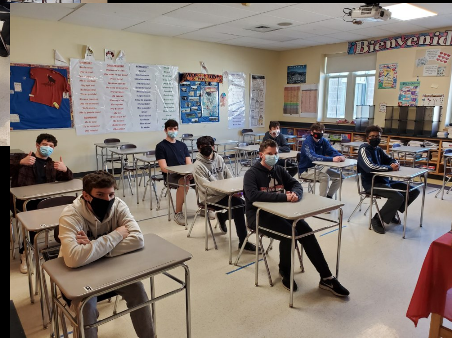
Shown with individuals at 2 ft and 3 ft